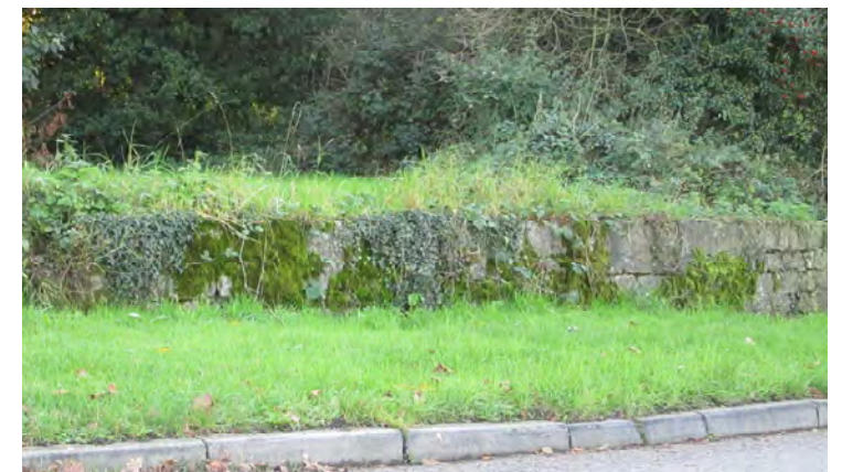
Image of current retaining wall