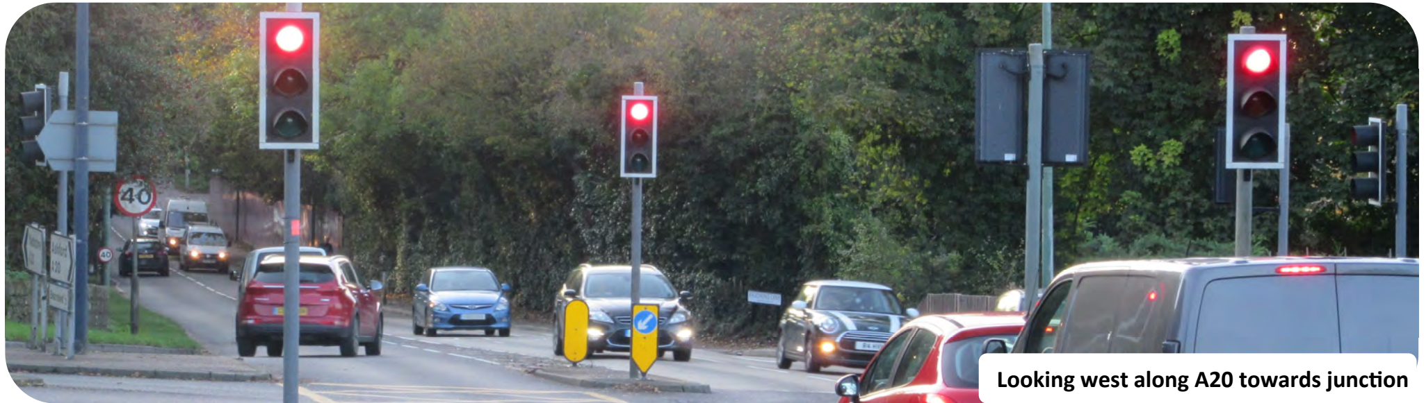
Looking west along A20 towards junction