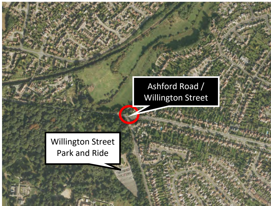
Aerial view of Ashford Road / Willington Street

The JTB expressed some support but asked for a greater degree of improvement. The design revisions now included in Option 2 present the most significant improvements to congestion, in the region of 36% in the morning peak period and 39% in the evening peak period and have been endorsed by the JTB.