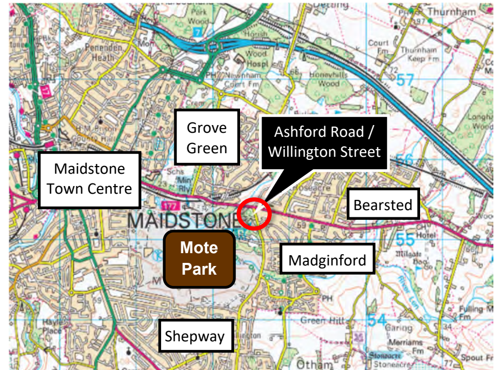
Map of Ashford Road / Willington Street